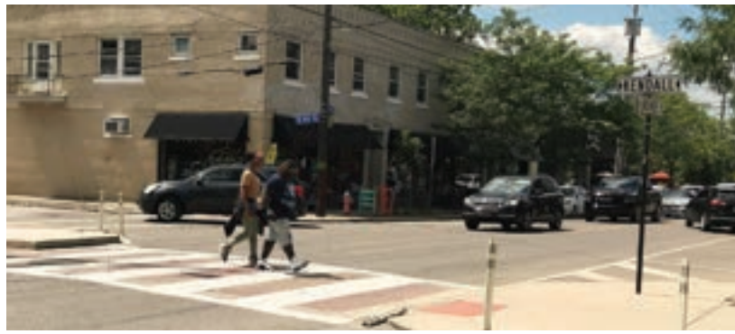
Larchmere residents complained during a July 29 Ward 6 safety meeting that sidewalk "bump-outs" like this one at Kendall Road are ineffective.