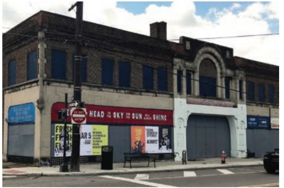
The vacant Moreland Theater Building at the corner of Buckeye Road and East 119th Street may become the cornerstone of an arts district centered on Black creators and entrepreneurs.

parcs and public spaces. A $2 million joint initiative from Fifth Third Bank and nonprofit Enterprise Community Partners supports residents purchasing rehabilitated single-family and two-story homes, along with money for existing homeowners to make needed repairs.