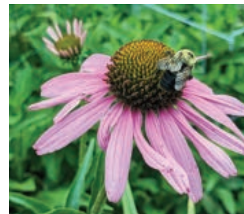
Native plants welcome bees to the CHALK neighborhood.

Locally, the project has not just drawn pollinators but brought CHALK closer together, Weingart says. “Now more neighbors know each other.” She’s thinking next of a project for rain gardens or composting.