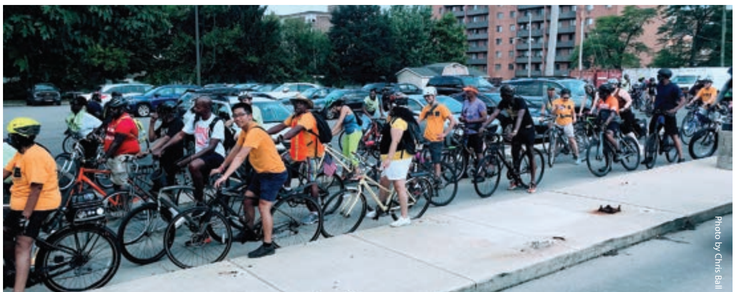
A group of 100 bikers exits the parking lot behind Amos Norwood Park for a July 13 group ride organized by Bike Your Neighborhood.

Advocacy is at the heart of Bike Cleveland. One of its programs is a seven-week transportation academy. Weekly sessions teach bikers and walkers why streets look the way they do and how to organize their community to make them better. Participants must apply, and they receive a small stipend once they finish the course. This year’s class is filled, but information can be found under the advocacy tab at bikecleveland.org .