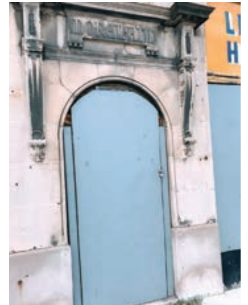
“Moreland” is carved above the doorway of the vacant Moreland Theater Building, built in 1927.