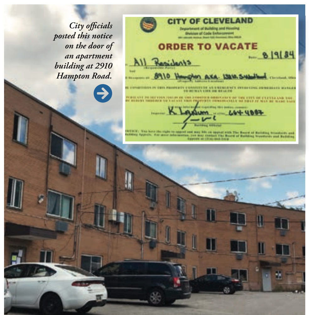
Residents have been ordered to vacate an apartment building at 2910 Hampton Road due to uninhabitable living conditions.

From there, immediate next steps focused on relocating tenants to more stable housing, “as the owner’s lack of ongoing maintenance has created a hazardous and unsustainable living situation for tenants.”